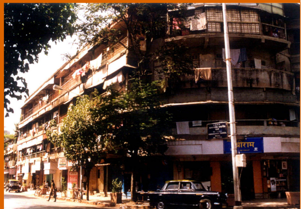
Photo: Typical chawls