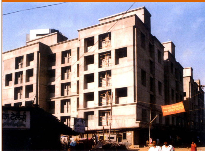
Photo: Slum redevelopment