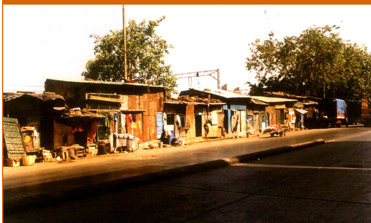
Photo: Slums along a street