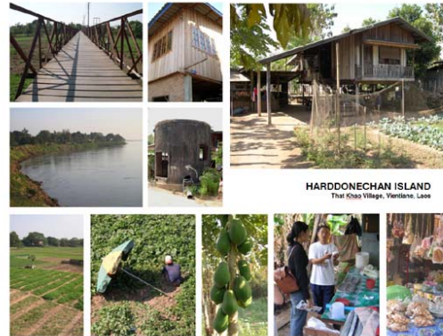
HARDDONECHAN ISLAND Thei Khoo Village, Xiengkhoi, Laos